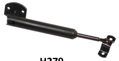
H279 Metal and Plastic

These Cabinet Door Support instructions assume a position looking toward the cabinet door.